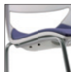
Carter per impilabilità nelle versioni con sedile imbottito Under seat shell to stack the chairs for padded seat versions