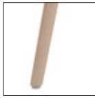
LE 4 gambe acero verniciato (con feltrini) 4 legs painted maple (with feet glides)