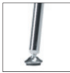
ACC Cromato Chromed frame