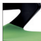
....S C/sedile imbottito W/padded seat