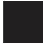
N Nero Black Noir Schwarz Negro