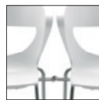
Carter per agganciabilità sedie Under seat shell with linking device Ingombro L=56 Overall dimensions L=56