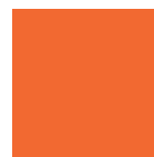
A Arancio Orange Orange Orange Naranja