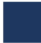
B Blu Blue Bleu Blau Azul