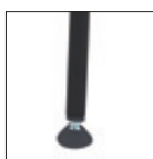
AN Vern. col. nero Black painted frame