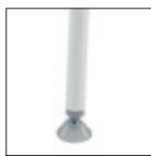
AB Vern. col. bianco White painted frame