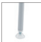
AV Vern. col. alluminio Alu painted frame