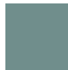
P Turchese Turquoise Turquoise Türkis Turquesa