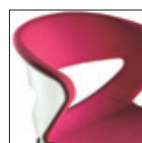
....SS C/sedile-schienale imbottito W/padded seat-back